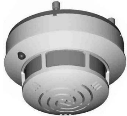
Fig. 1 SSD 515-xS

The SSD 515-xS is available in four sensitivities. See Technical data.